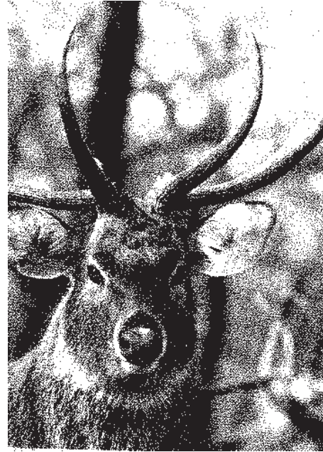
Cervus eldi eldi

Through the efforts of the Forest Department of Manipur the area is now a National Park. Vigorous protection measures have ensured the steady increase of the Sangai wild population to about 137 individuals (1994). In many respects, survival of the Sangai is dependent on the goodwill of the people of the area — and their willingness to make some sacrifices for this unique species.